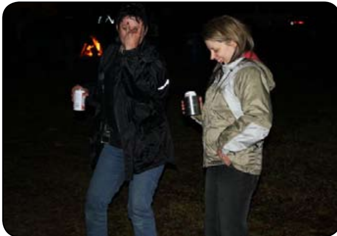
Below: Me & Mel