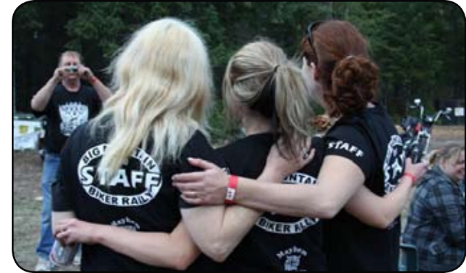
Above: The Leading Ladies