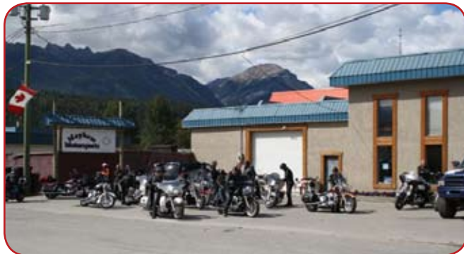
Above: Poker Run Mayhem Stop

Set up the next day for bikers to register for the events and/ or stay for the weekend. Friday the bikers arrived, a few colors as well! Good to see! The festivities commenced with a few brews and a lot of good friends!