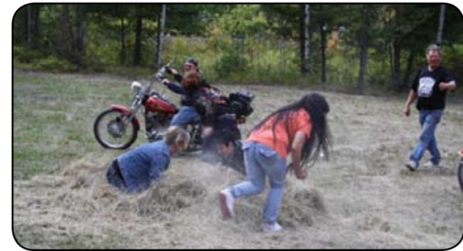
Above: The Potato Hunt