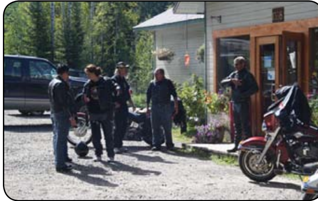
Above: Poker Run Stop - Moberly Pub

The Biker Rodeo was a hoot and a half... some fell off... some won the prize. lol.. it was all good!