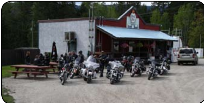
Above: Poker Rin Stop - Parson Store

Just a lot of good friends, old and new having a blast, like a big family, that all got along, with no animosity whatsoever.