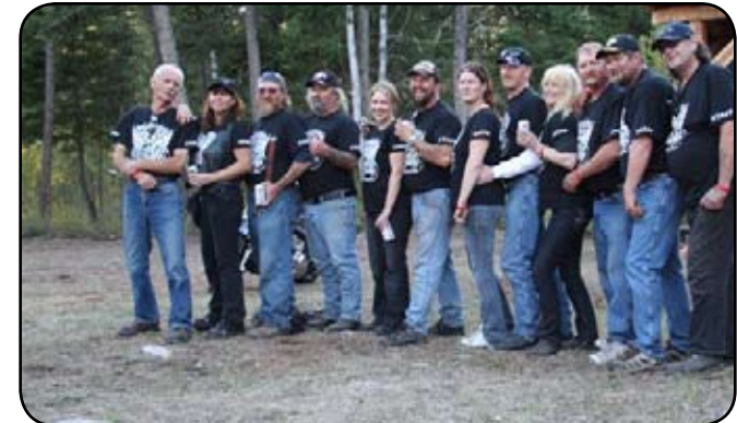
Below: The Staff